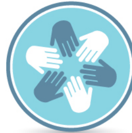
RESPONSIBLE SUPPLY CHAINS & HUMAN RIGHTS