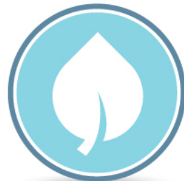
HEALTH, SAFETY & ENVIRONMENT