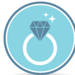
DIAMONDS, GOLD & PLATINUM GROUP METAL PRODUCTS