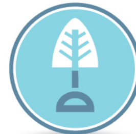
RESPONSIBLE MINING SECTOR