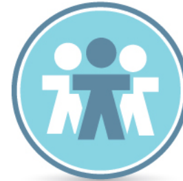
LABOUR RIGHTS & WORKING CONDITIONS