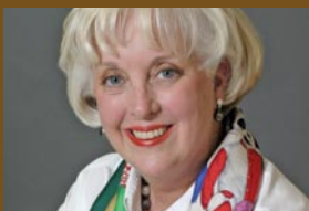
New Director of North American Operations

implementation system that will use independent third-party monitors to credibly demonstrate that the practices of CRJP’s members are responsible.”