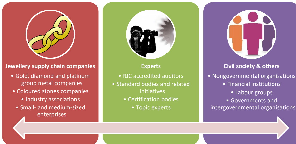
Figure 2. RJC stakeholder map

The RJC COP aims to address a wide range of topics, that are of interest to many stakeholders. Figure 2 maps our key stakeholder groups: the diverse companies that implement the COP; the experts that support the COP's assurance and implementation, or have related experience in standard setting; and the civil society groups and other stakeholders with an interest in the COP's potential impacts.