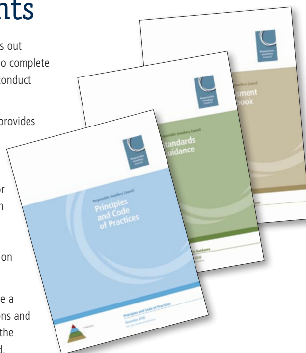
Continued next page

The implementation documents provide a detailed and complete set of instructions and guidance to assist Members to follow the Code of Practices and become certified.